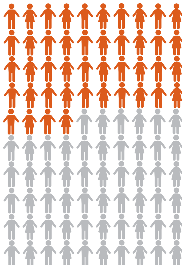
Figure 2. Forty-four percent of Chicago children experienced an increase in at least one mental or behavioral health symptom during the pandemic compared with before the pandemic

During the pandemic, restrictions on social gatherings, cancellations of some youth activities and shifts to remote learning have changed the kinds of activities that children and adolescents are engaging in. To better understand how