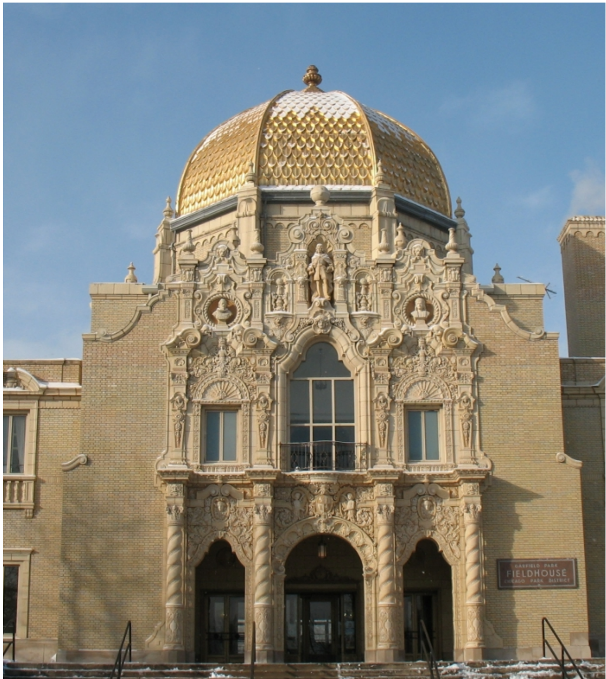
Garfield Park Conservatory

3136-3158 W. 5th Avenue: 0.75 acres of land 3137-3159 W. 5th Avenue: 0.73 acres of land Note: all measurements are approximate and subject to revision