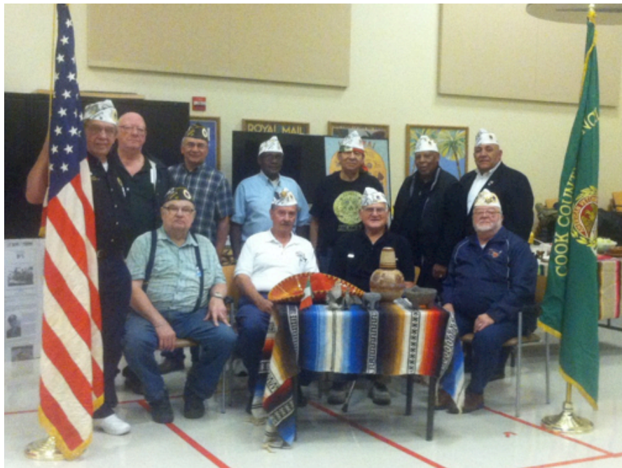
September 18, 2014 AMVETS District I Meeting at Edward Hines VA Medical Center

Executive Board members pose for picture before they were treated to Mexican Food Hosted by AMVETS Post #326, celebrating Hispanic Heritage Month after the meeting.